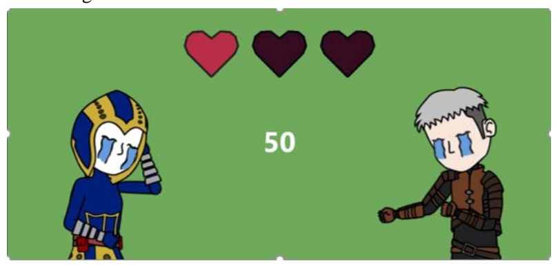
Fig. 2: Game Protagonists Emiroo and Chiroo (left to right)

of the game is set to orthographic view so that the player can navigate well into the entire scene and objectives of the game. The player has a wide range of tapping and dragging, making it easier to the player to complete the objectives into the game.